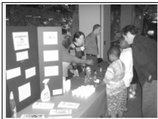
UNC-Pembroke Chemistry Department presents concepts of "household chemistry" to visitors at the NC Museum of Natural Sciences during National Chemistry Week