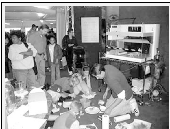
Paper chromatography butterflies were a favorite NC State Fair activity at the NC-ACS booth in the BioFrontiers Exhibit.

Volume 33: Number 2 Bradley E. Sturgeon, Editor 4400 Currie Court Raleigh, NC 27613